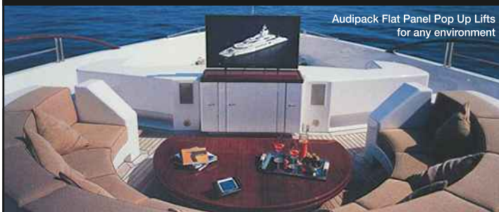
Audipack Flat Panel Pop Up Lifts for any environment