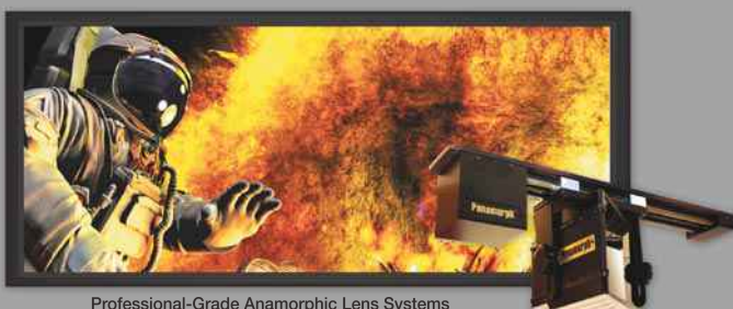
Professional-Grade Anamorphic Lens Systems