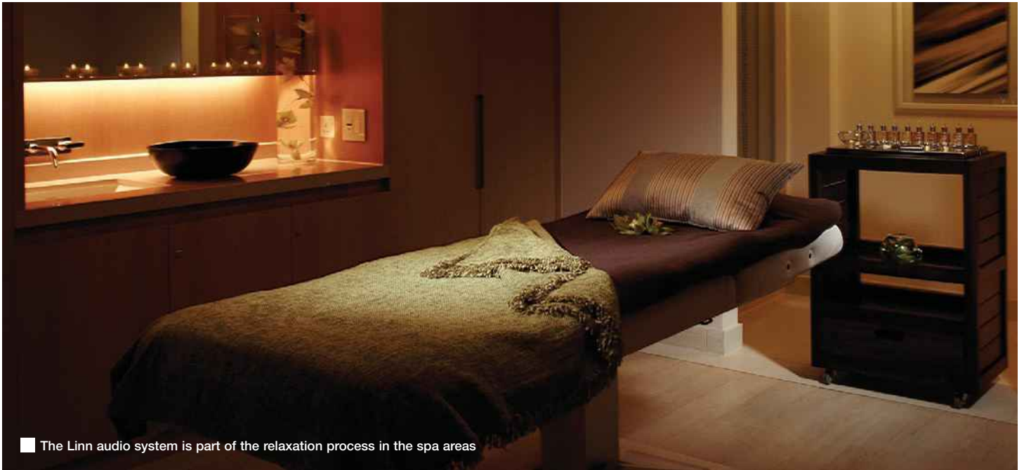
■ The Linn audio system is part of the relaxation process in the spa areas