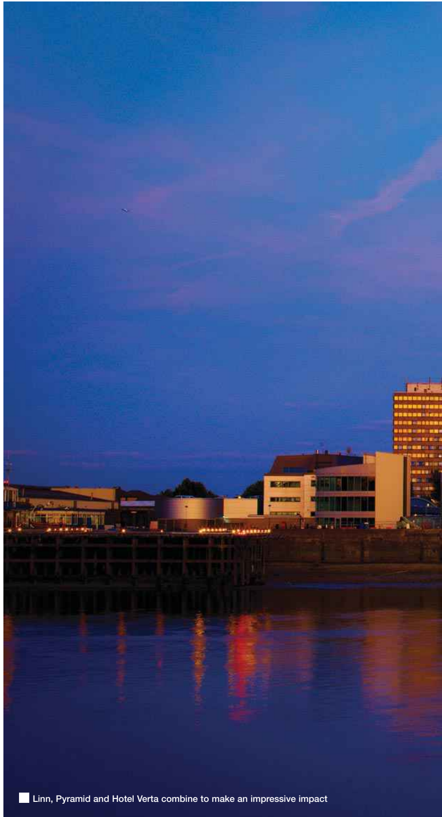
■ Linn, Pyramid and Hotel Verta combine to make an impressive impact